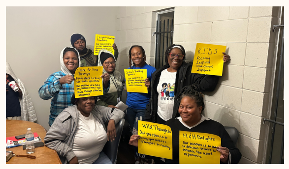
TRANSFORM YOUR CAREER PATH GRADUATES