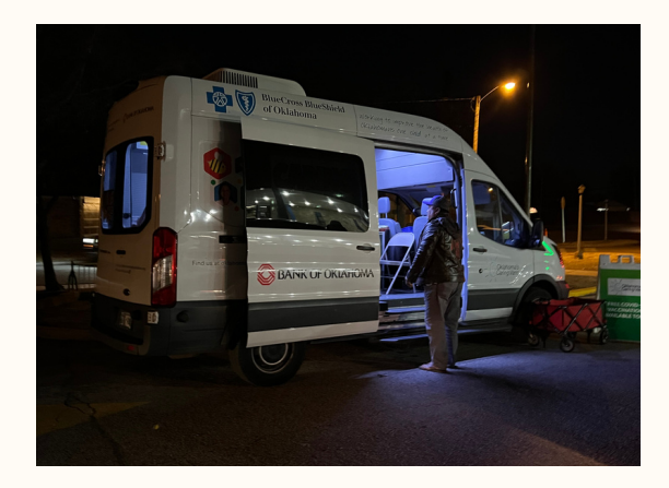
VACCINE CLINIC IN PARTNERSHIP WITH MADE TO SAVE AND TPS