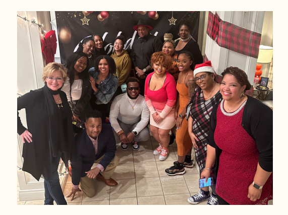
GREENWOOD LEADERSHIP ACADEMY SNEAKER BALL