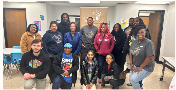
GROWING GREENWOOD THIRD COHORT GRADUATES